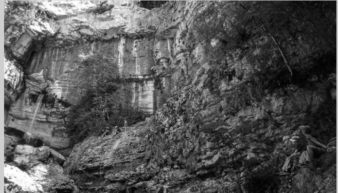
Cascade de la Doria.

The congress also offered various caving-related competitions. The U.S. cavers excelled in the photography, rope course and mapping competitions, bringing home the fastest woman rope climber award and several honorable nominations for photography and mapping sections. ■